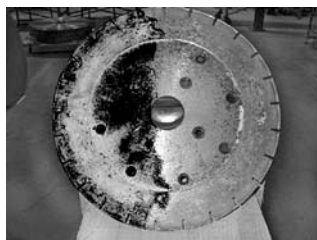
After 1 hour

AMAZING EVAPO-RUST! See these and other dramatic full color images and testimonials on our website.