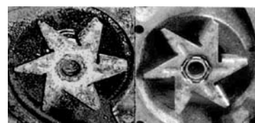
After 2 hours