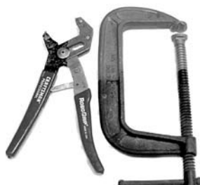
After 1 hour