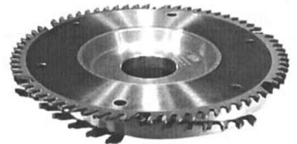
RH Rotation Image Shown