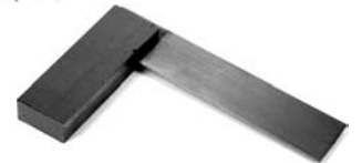
PLK-07 6" Machinist Square