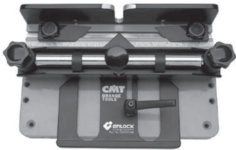
ENLOCK 1 Joining System