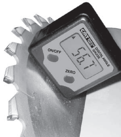
DAG-01 Digital Angle Gauge