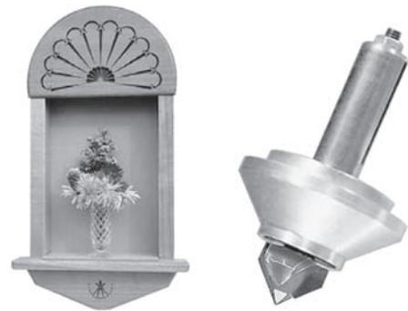
CMT-RCS 3-D Router Carver System