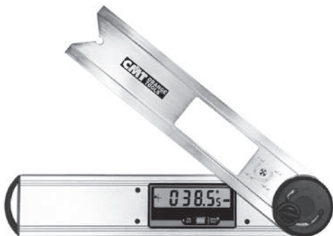
DAF-001 Digital Angle Finder