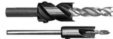
Adjustable Counterbores (No. 123)