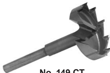
No. 149 CT