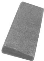
TA183 Silicon Carbide Slip Stone