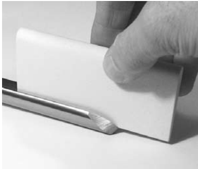
FAS-4 Hard Arkansas Stone