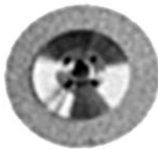
GWC931 W/wheel mounted