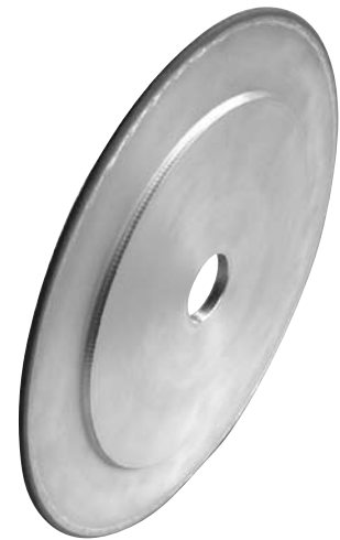
FF4-8DIA (10 x 1/4 x 1-1/4" u = 1/8", r = 1/16")

u = This refers to the thickness of the wheel at the outside periphery r = This refers to the radius.