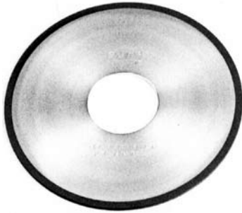
Weinig Super Abrasive Wheel