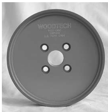
Weinig #909 & #912 wheel Part # 6A92B